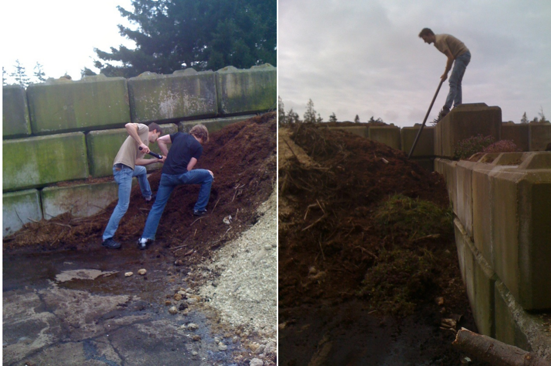
Figure 5: Second sample collection techniques