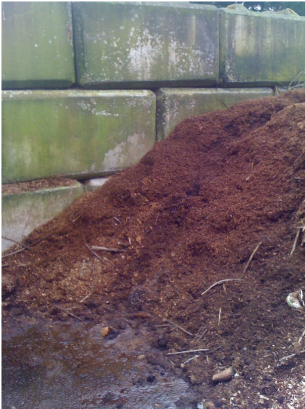
Figure 4: First cell at the Farm's Compost heap (after turning)