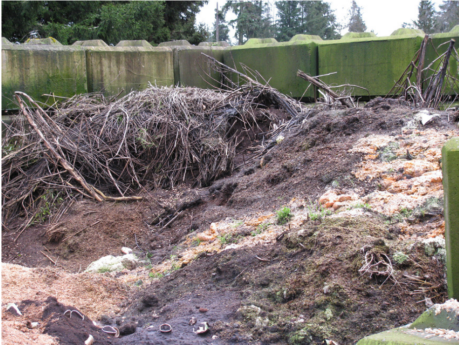
Figure 3: First cell at the Farm's Compost heap (before turning)