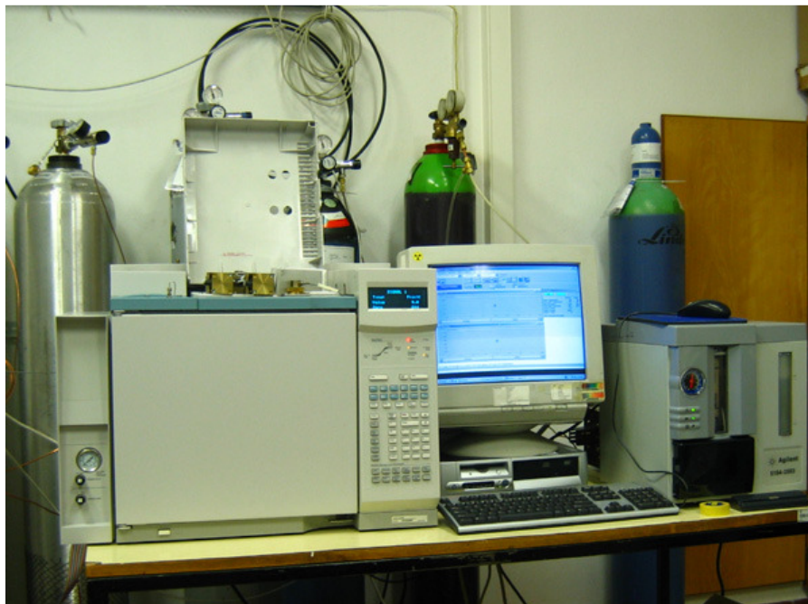
Figure 1 : Gas Chromatography (GC) Unit

The gas samples released by the incubated compost samples are collected in a syringe. Several microliters of the collected samples are injected into heated injection port of the Gas Chromatography (GC) Unit (Figure 1).